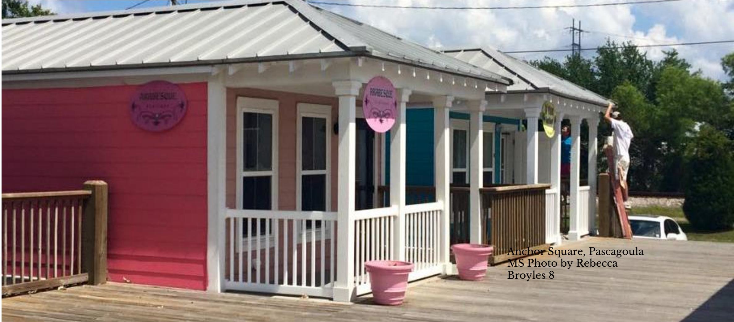
Anchor Square, Pascagoula MS 8