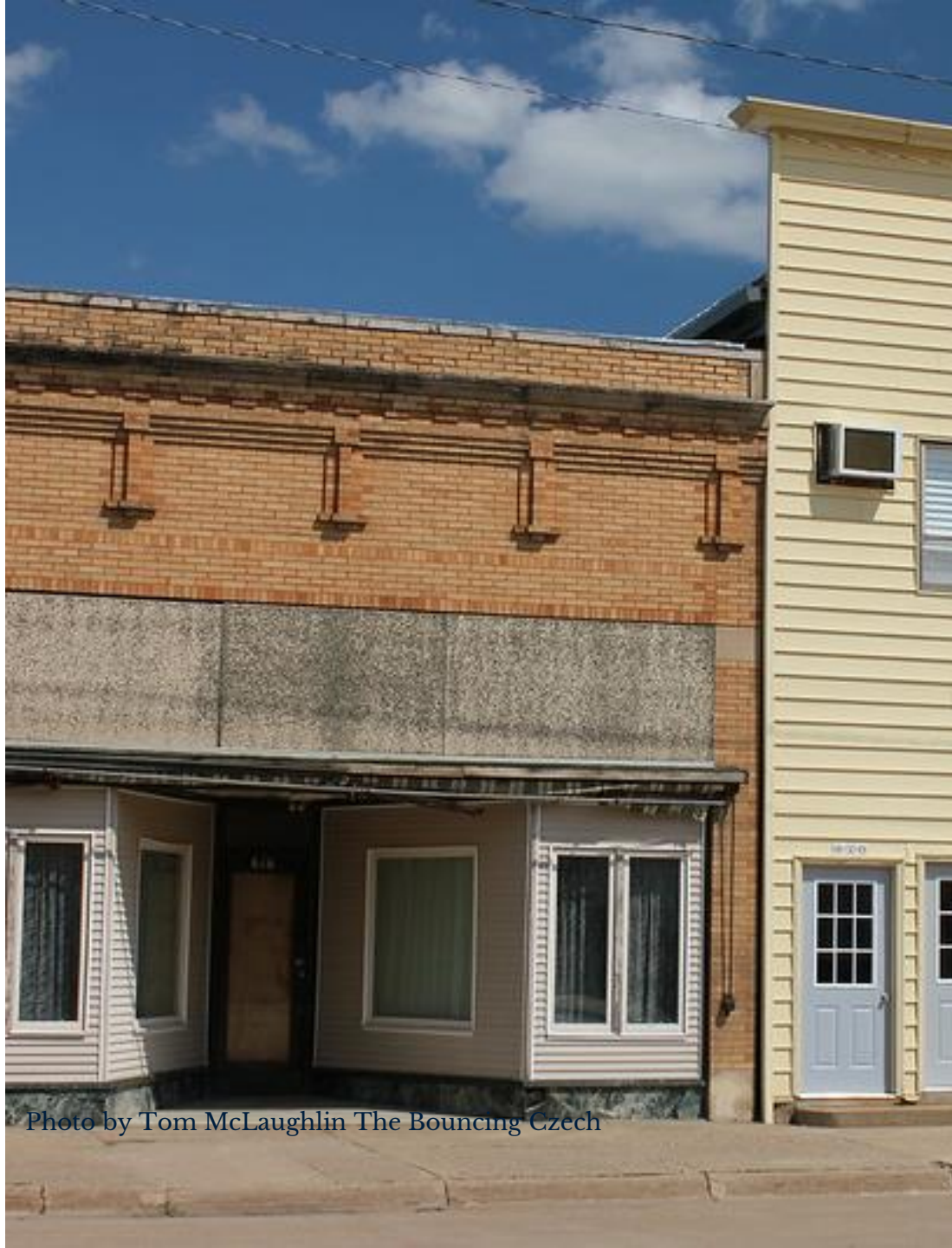
The Bouncing Czech