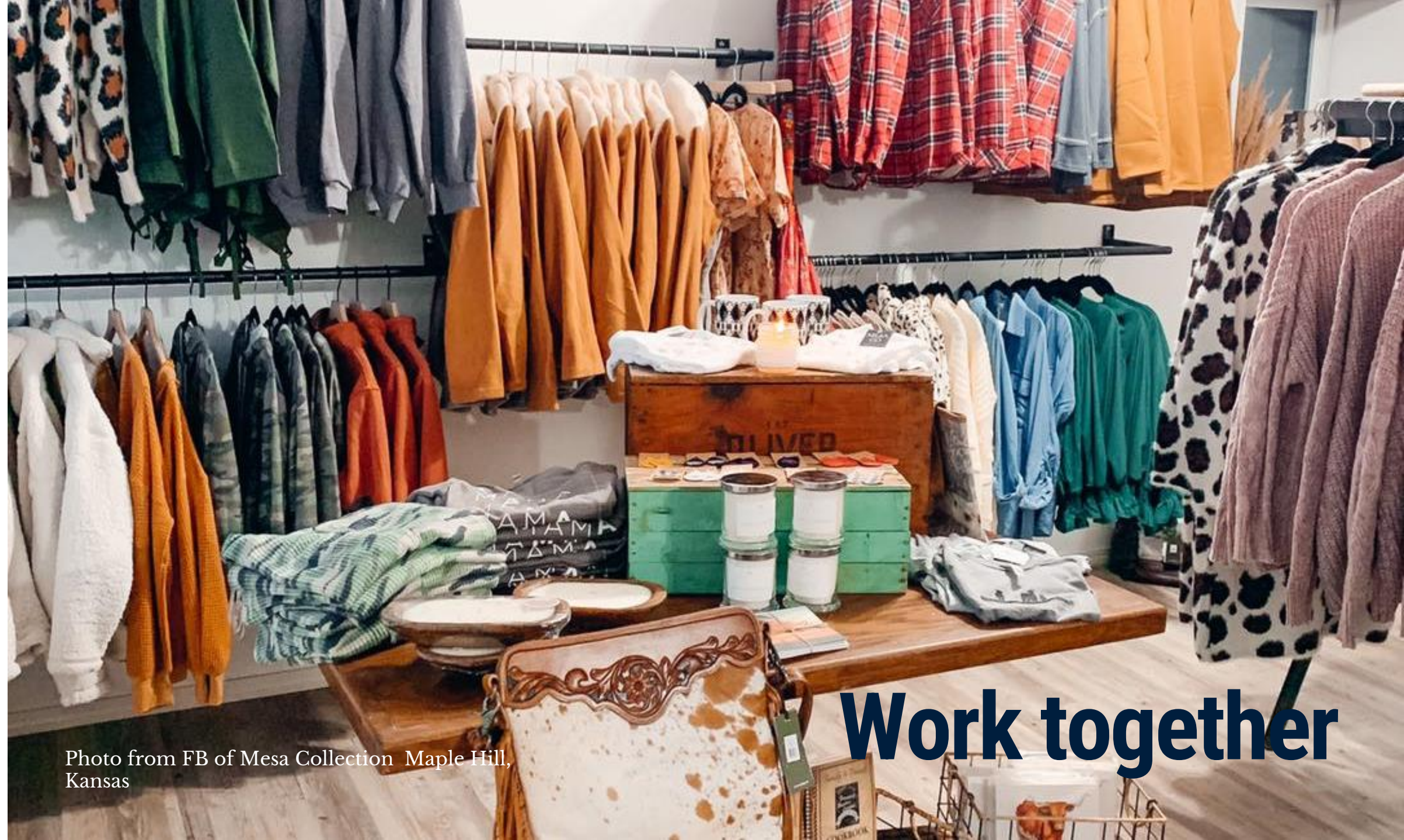
Photo from FB of Mesa Collection Maple Hill, Kansas