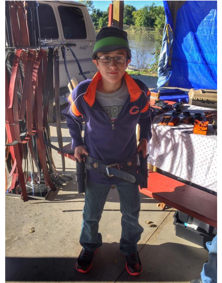
Van Buren County, Iowa